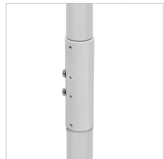
Allows a rigid external join of 2x BT5935 poles to extend the drop of System V installations