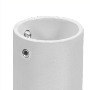
4mm heavy duty steel capable of supporting substantial loads