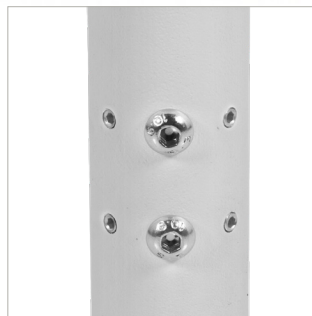
Safety bolt holes ensure a secure connection to System V poles