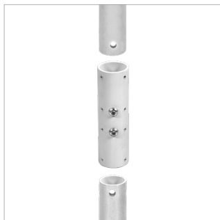
Attaches directly to BT5935 ø38mm poles